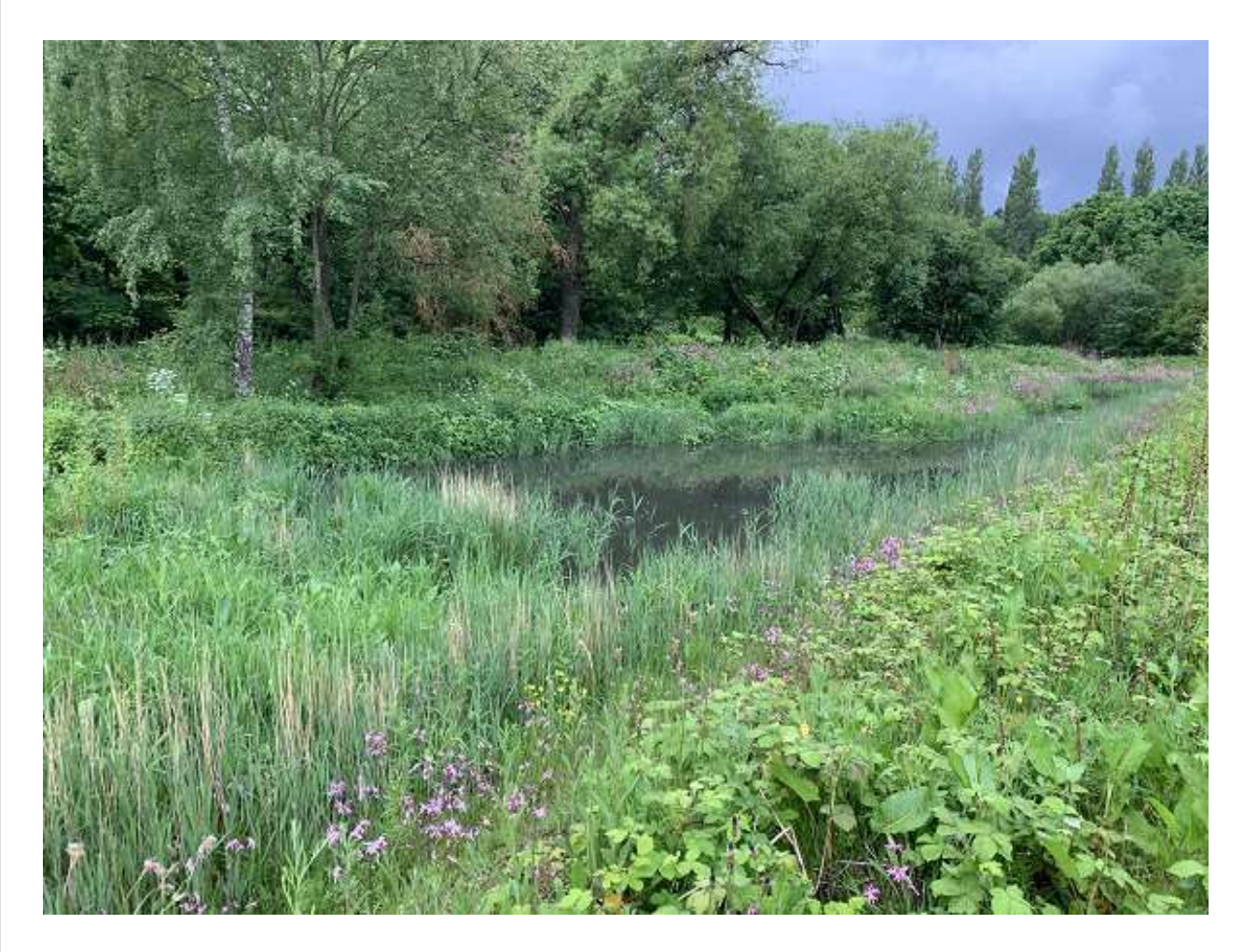
Fig. 2 Wetland created alongside the River Alt in Croxteth Park

Using the <u>storymap</u>, needs can be identified and prioritised and solutions and improvements established to meet the needs.